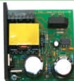
IPS-DK 401 controller board